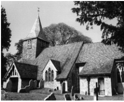
All Saints Church

or 31K CYCLE .....also, 4K fun run .....or 14K cycle